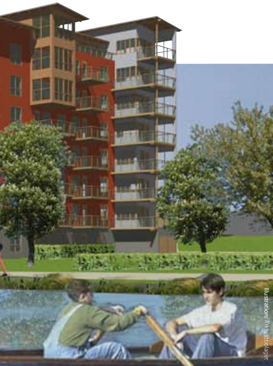
Illustration: Mikaela Enger